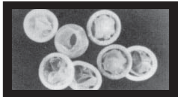
Top: Male Condoms