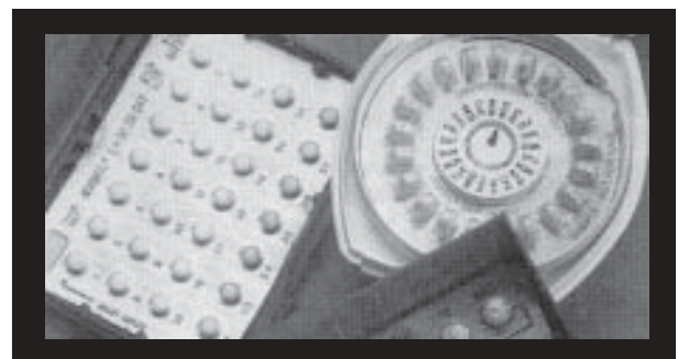
Top right: Birth control pills