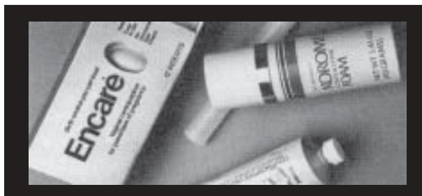
above: Spermicide and foam