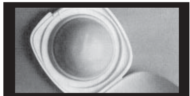
Bottom right: Diaphragm